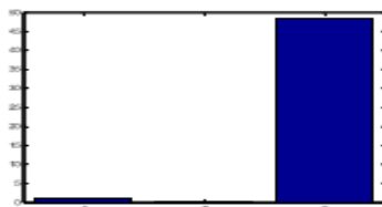
Result of DCT