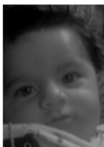
Figure 1 Original image

In this section performance of various parameters has been analyzed: compression ratio, peak signal to noise ratio, Mean square error, and bit error rate. PSNR is usually expressed in logarithmic decibel scale; it is most commonly used as measure of quality of reconstruction image compression. Compression ratio can be varied according to image compression & image quality MSE is called square error loss measures the square of "error".