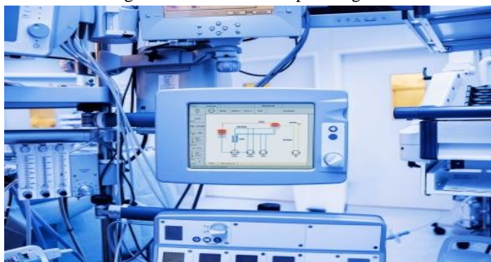
Figure: 3 Medical Cyber-Physical Systems

Medical CPS refers to modern medical technologies in which sophisticated embedded systems equipped with network communication capabilities, are responsible for monitoring and controlling the physical dynamics of patients' bodies. Examples include proton therapy machines, electro-anatomical mapping and intervention, bio-compatible and implantable devices, and robotic prosthetics. Malfunctioning of these devices can have adverse consequences for the health of the patient. The verification, validation and certification of their reliability and safety are extremely important and still very challenging tasks, owing to the complexity of the involved interactions. The modelling and efficient simulation of the patient body will play a key role in the design and validation of Medical CPS and in the development of personalized treatment strategies. To this end, our research has largely focused on modelling and analysis techniques for cardiac dynamics to predict the onset of arterial and ventricular fibrillation. In [3] we show that with a normal desktop with GPU technology, it is possible to achieve simulation speeds in near real-time for complex spatial patterns indicative of cardiac arrhythmic disorders. Real-time simulation of organs without the need for supercomputers may soon facilitate the adoption of model-based clinical diagnostics and treatment planning.