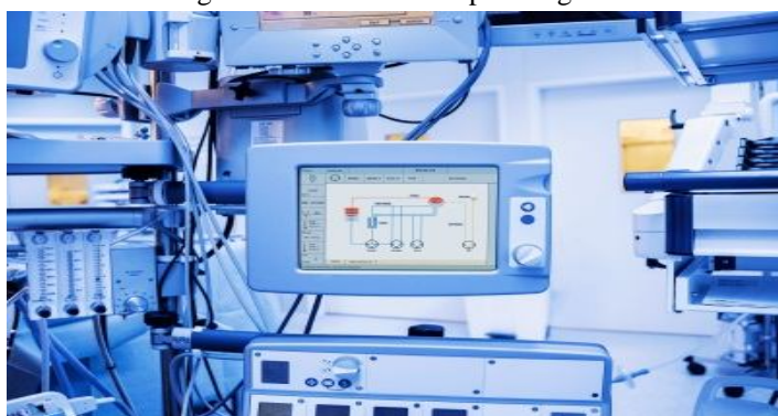
Figure: 3 Medical Cyber-Physical Systems

Medical CPS refers to modern medical technologies in which sophisticated embedded systems equipped with network communication capabilities, are responsible for monitoring and controlling the physical dynamics of patients' bodies. Examples include proton therapy machines, electro-anatomical mapping and intervention, bio-compatible and implantable devices, and robotic prosthetics. Malfunctioning of these devices can have adverse consequences for the health of the patient. The verification, validation and certification of their reliability and safety are extremely important and still very challenging tasks, owing to the complexity of the involved interactions. The modelling and efficient simulation of the patient body will play a key role in the design and validation of Medical CPS and in the development of personalized treatment strategies. To this end, our research has largely focused on modelling and analysis techniques for cardiac dynamics to predict the onset of arterial and ventricular fibrillation. In [3] we show that with a normal desktop with GPU technology, it is possible to achieve simulation speeds in near real-time for complex spatial patterns indicative of cardiac arrhythmic disorders. Real-time simulation of organs without the need for supercomputers may soon facilitate the adoption of model-based clinical diagnostics and treatment planning.