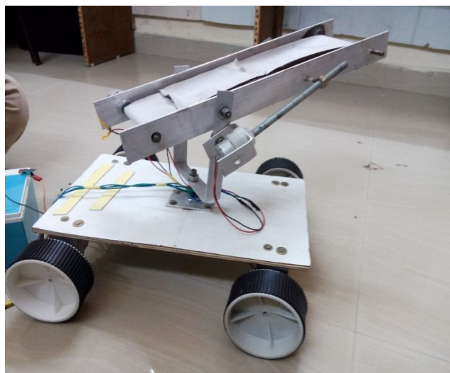
Fig: 3.3 Final assembly model Specifications

The equipment consists of a base plate supported with 4 wheels for mobile operation. This plate is fitted with a clamping arrangement over which a belt conveyor is arranged. The clamp can be rotated for 360 0 degrees movement. There is an arrangement for the conveyor belt to tilt up and down. All the movements of the equipment are controlled by the D.C motor. Eight motors are assembled for these operations. To turn the conveyor belt in 360 degrees rotation a vertical motor is arranged. All the equipments used in this assembly are run with the help of battery. In this assembly the components arranged can be handled with a hand held device.