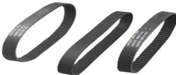
Fig:3.2 Conveyor Belt

A conveyor belt is the carrying medium of a belt conveyor system. A belt conveyor system consists of two or more pulleys (sometimes referred to as drums), with an endless loop of carrying medium the conveyor belt that rotates about them. One or both of the pulleys are powered, moving the belt and the material on the belt forward. The powered pulley is called the drive pulley while the unpowered pulley is called the idler pulley. There are two main industrial classes of belt conveyors; Those in general material handling such as those moving boxes along inside a factory and bulk material handling such as those used to transport large volumes of resources and agricultural materials such as grain, salt, coal, ore and more.