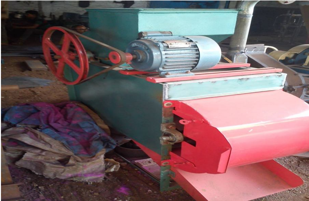
Photo 1 Final Assembly of Groundnut Decorticator