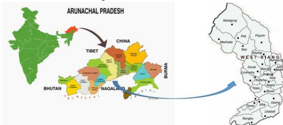
Fig.1 Location map of study area