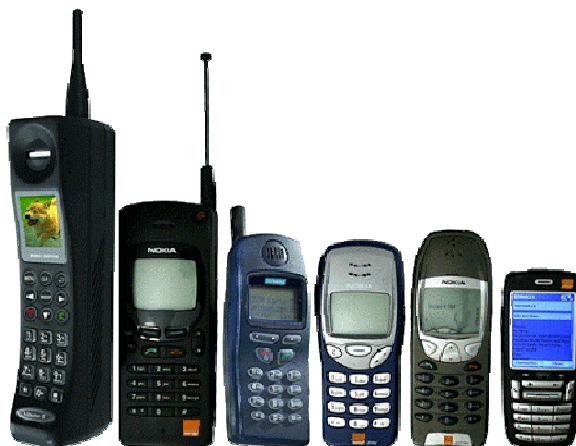
Fig.2: 1g mobile phone