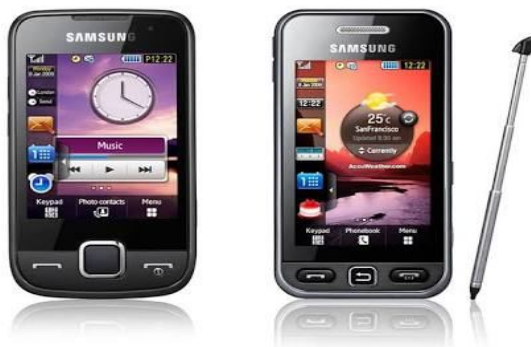
Fig.4: 3g mobile phone