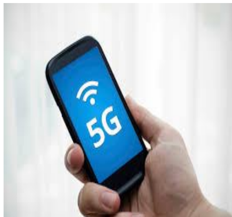
Fig.6: 5g mobile phone

could offer. There is messenger, photo gallery, and multimedia applications that are also going to be the part of 5G. There would be no difference between a PC and a mobile phone rather both would act vice versa.