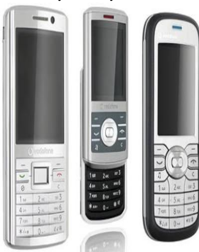
Fig.3: 2g mobile phone

2G cellular telecom networks were commercially launched on the GSM standard in Finland by Radio linja in 1991. 2G technologies enabled the various mobile phone networks to provide the services such as text messages, picture messages and MMS (multimedia messages). 2G technology is more efficient.. It was planned for voice transmission with digital signal and the speeds up to 64kbps.2G technology holds sufficient security for both the sender and the receiver. All text messages are digitally encrypted. This digital encryption allows for the transfer of data in such a way that only the intended receiver can receive and read it