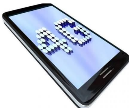
fig.5: 4g mobile phone

The basic feature of 3G Technology is fast data transfer rates. However this feature is not currently working. properly because, ITU 200 is still making decision to fix the data rates. Network authentication has won the trust of users, because the user can rely on its network as a reliable source of transferring data. . 4G is a conceptual framework and a discussion point to address future needs of a high speed wireless network. It is expected to emerge around 2010 – 2015. 4G should be able to provided very smooth global roaming ubiquitously with lower cost.