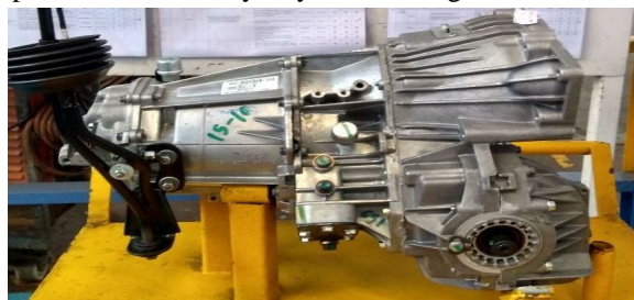
Fig. 1: Winger Gearbox

Winger is front wheel drive car. The main aim of gearbox is to transmit power from engine to the wheels of vehicle. In winger, transaxle with synchromesh gearbox is used. The transaxle is defined as “In the automotive field, a transaxle is a major mechanical component that combines the functionality of the transmission, the differential, and associated components of the driven axle into one integrated assembly.” There is absence of propeller shaft in between the gearbox and differential. Mainly transaxle is used in light motor vehicles as compared to heavy motor vehicle to carry out load. Synchromesh gearbox is one of the gearboxes which are used to transmit power from input shaft to output shaft. The working of synchromesh gearbox is similar to Constant mesh gearbox but the only difference is, dog clutch is replaced by synchromesh devices. One big problem occur in constant mesh gear box is that when the driver engage the dog clutch, the main shaft and gear to be meshed running at different speed. So when engage this gear cause wear and tear of dog clutch. This problem is solved by a synchromesh gear box hence it is used with transaxle.