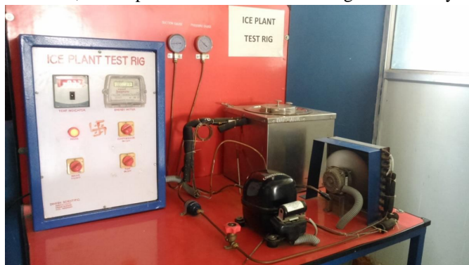
Figure 1. Test rig of vapour compression refrigeration system

The Refrigeration test rig works on simple vapor compression refrigeration cycle and uses R600 as a refrigerant. It is environment friendly. The system is fabricated such that students can observe and study vapor compression cycle, its component principle & working. The arrangement of parts such that, all the parts are visible and working can be easily understood.