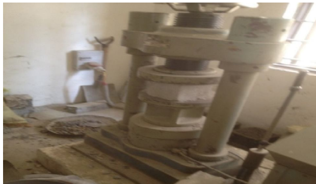
Table.III 7 days compressive strength test results