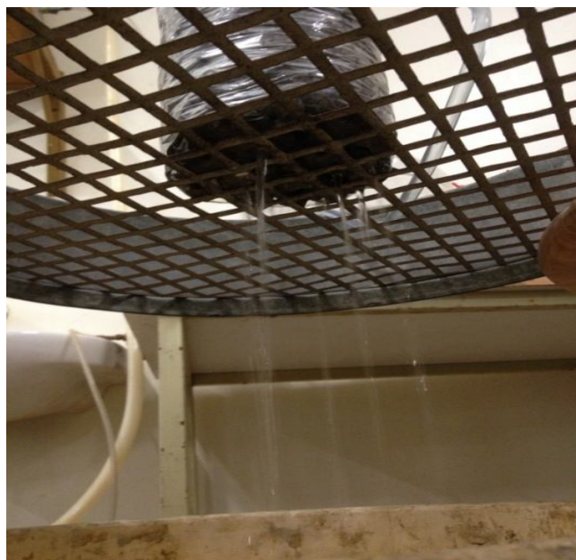
Fig.1 Water passing through the pervious concrete specimen during permeability test

Formulae: Observations are started after steady state of flow has reached. The heads at two successive time intervals ' t_1 ' and ' t_2 ' is recorded as ' h_1 ' and ' h_2 ' respectively.