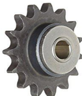
Fig. Chain sprocket