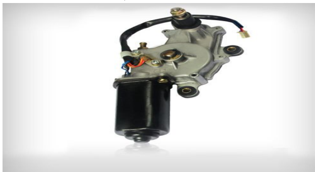
Fig. Wiper Motor