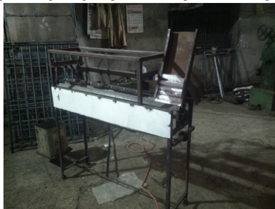
Fig : yarn removal machine

In textile, productivity has great influence on yarn and fabric production. Optimizing the output in this sector is a big challenge; to achieve this goal the role of an individual person regarding the production department has a great importance.