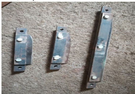
Fig. HSS Blade

It is often used in power-saw blades and drill bits. It is superior to the older high-carbon steel tools used extensively through the 1940s in that it can withstand higher temperatures without losing its temper (hardness). This property allows HSS to cut faster than high carbon steel, hence the name high-speed steel. At room temperature, in their generally recommended heat treatment, HSS grades generally display high hardness (above Rockwell hardness 60) and abrasion resistance (generally linked to tungsten and vanadium content often used in HSS) compared with common carbon and tool steels.