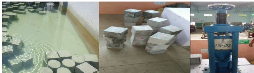
28 DAYS OF IMMERSION IN WATER FOR CURING.

Compressive strength of cubes is determined at 28 days using compression testing machine (CTM). A cube compression test was performed on standard cubes of size 150mm 150 mm at 28 days of immersion in water for curing.