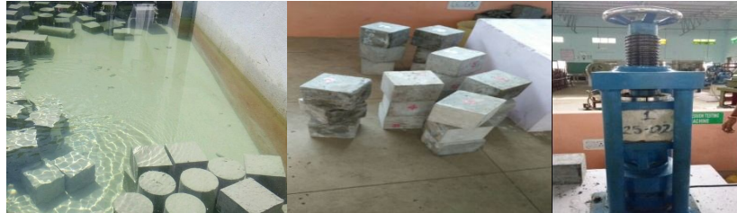
28 DAYS OF IMMERSION IN WATER FOR CURING.

Compressive strength of cubes is determined at 28 days using compression testing machine (CTM). A cube compression test was performed on standard cubes of size 150mm 150 mm at 28 days of immersion in water for curing.