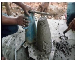
Fig: 1 Slump cone test

The concrete slump test shown in Figure 1 is an empirical test that measures workability of fresh concrete. The test measures consistency of concrete in that specific batch. It is performed to check consistency of freshly made concrete.