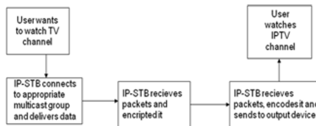
Fig.1. IPTV-STB Operation

Interactive television is a form of media convergence, adding data services to traditional television technology.