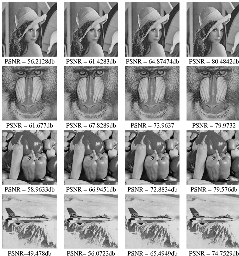
Figure 4: Recovered image and their corresponding PSNR value

We got an average PSNR of 27.71045 db, 27.171 db, 27.08585 db and 27.19935 db for Lena, Baboon, Pepper, and Jet cover image respectively after the insertion of watermark.