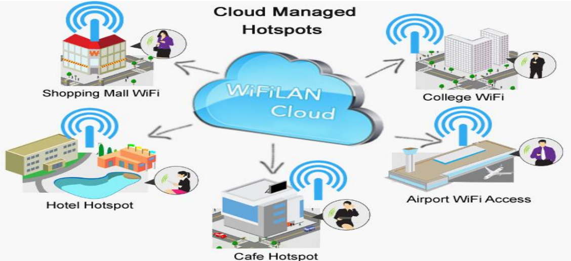
Figure 2.2 WIFI Cloud

association or a remote switch. A Wi-Fi network uses radio waves to wirelessly transmit information across a LAN, the reach of which can be extended by a Wi-Fi range extender. A PC uses a remote connector to interpret information transmitted by radio waves. These waves are different from those emitted by, for example, FM radios, for which frequency is measured in megahertz (MHz). Wi-Fi's signals are transmitted in frequencies of between 2.5 and 5 gigahertz (GHz). This signal is then transmitted from the adapter through a router, after which it is sent to the internet (figure-2.2).