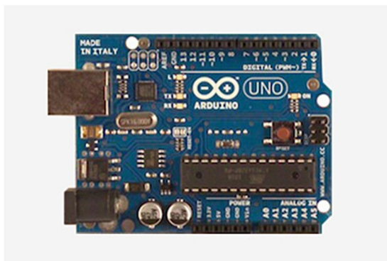
Fig 2: Arduino Board

The Arduino Board is used to convert the analogue values from the sensors to digital values. These values are further carried to the GSM board that updates the data in the server.