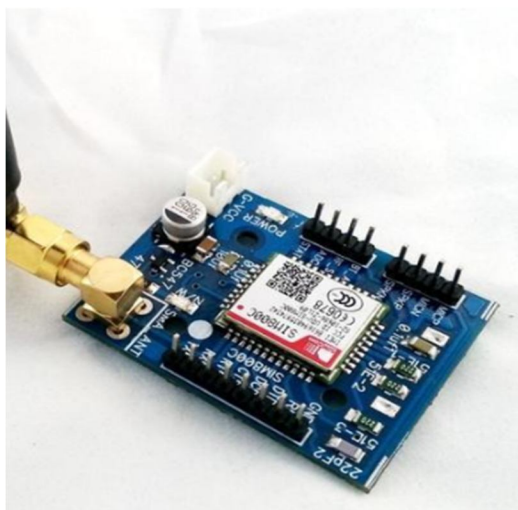
Fig 3: Sim800 IOT ver0 board