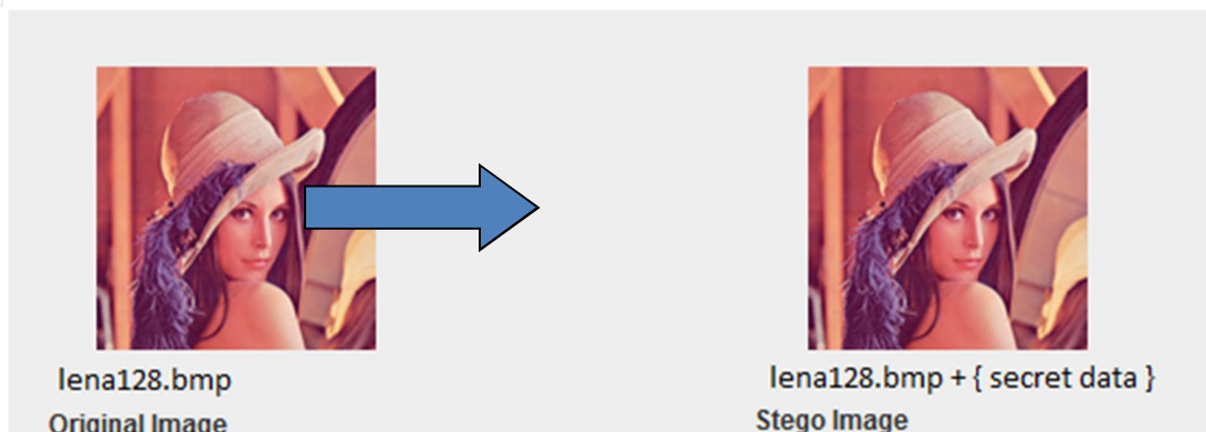
Fig: Process of Generating Stego-Image