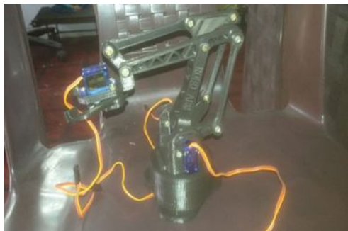
Fig.2: Robotic Arm