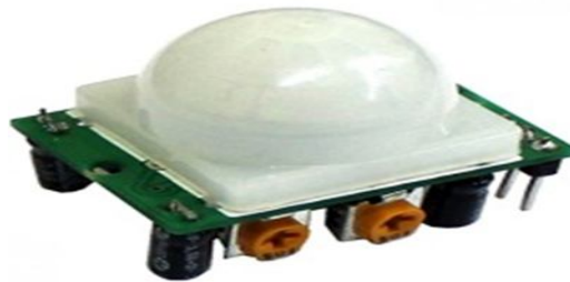
Fig.5: Motion detecting PIR sensors