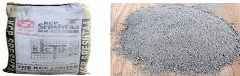
Fig. 1 KCP cement

0%, 2%, 4% and 8% with cement. The test conducted on cement is initial setting time, final setting time, soundness, specific gravity test. Conducted tests for cement