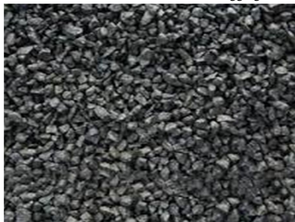
Fig. 3 Coarse aggregate

20mm size coarse aggregate is used. The exposure of is mild and Zone II is adopted. Coarse aggregate consists of 50% of self-weight of concrete and 70% of volume of concrete and conducted tests for coarse aggregate