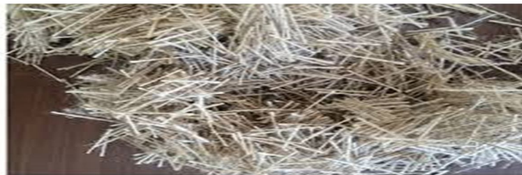
Fig. 5 Jute fibers

Jute fibers were collected from temples in the city to analyze the properties. The physical properties of jute fiber are shown below. And jute fibers of certain aspect ratio are used.conducted tests for Jute fibers