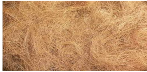
Fig. 4 Coir fibers