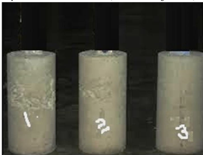
Fig. 7 cylinders

In this experiment, 30 numbers of cylinders were tested under UTM(universal Testing Machine)