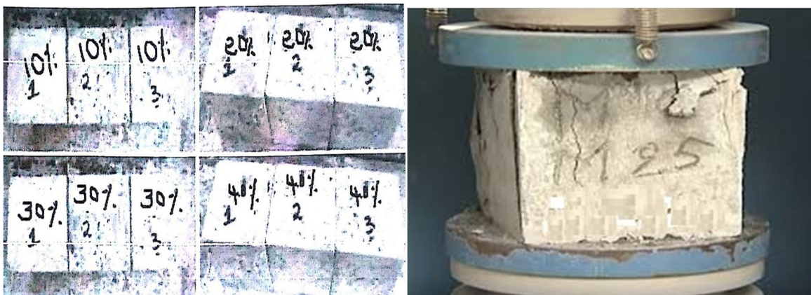
Fig. 6 Tested cubes

In this experiment, 30 numbers of cubes were tested under CTM (Compression Testing machine).