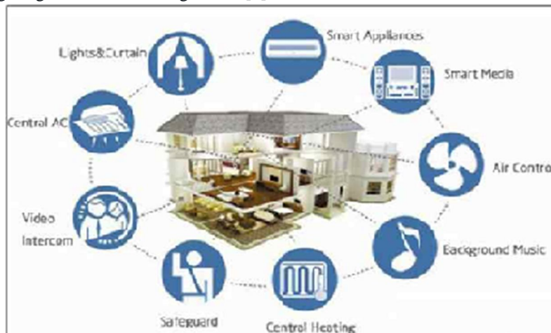
Fig:2: IOT Applications

Any device in home that uses electricity can be put on home network and at user command. Whether user can give that command by voice, tablet or smartphone and with remote control then that home reacts. Smart home applications are home security, home theater and entertainment, lighting and thermostat regulation.[5]