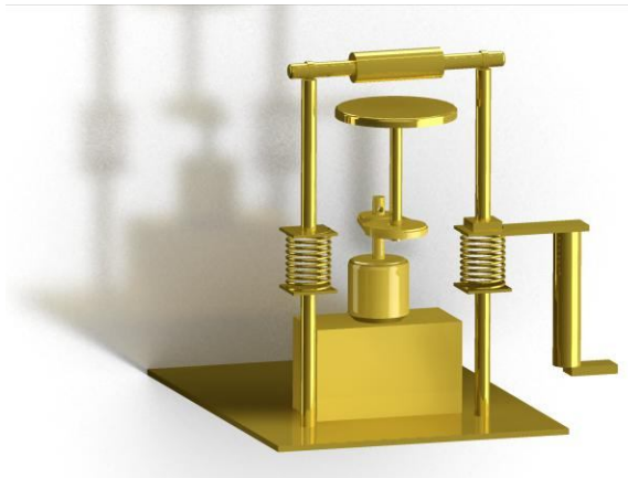
Fig 2: Cad Model Of Papad Making Machine