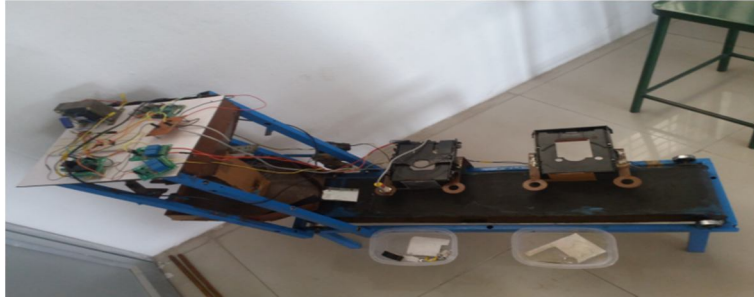
Fig.1 Conveyor System

A conveyor system is a common piece of mechanical handling equipment that moves materials from one location to another. Conveyors are especially useful in applications involving the transportation of heavy or bulky materials. Conveyor systems allow quick and efficient transportation for a wide variety of materials, which make them very popular in the material handling and packaging industries. In this work, it is used to carry the waste particles. The conveyor system used in this work is shown in fig.1.