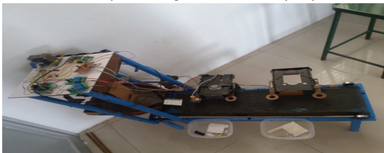
Fig.1 Conveyor System

A conveyor system is a common piece of mechanical handling equipment that moves materials from one location to another. Conveyors are especially useful in applications involving the transportation of heavy or bulky materials. Conveyor systems allow quick and efficient transportation for a wide variety of materials, which make them very popular in the material handling and packaging industries. In this work, it is used to carry the waste particles. The conveyor system used in this work is shown in fig.1.