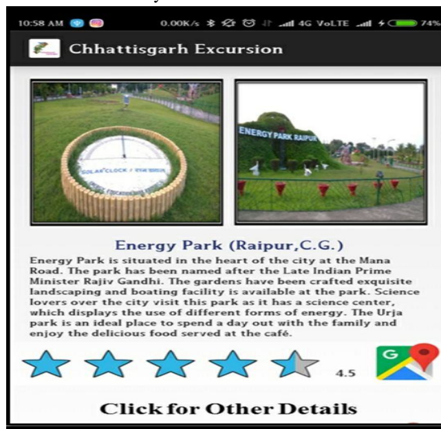
Figure: 5. Energy Park