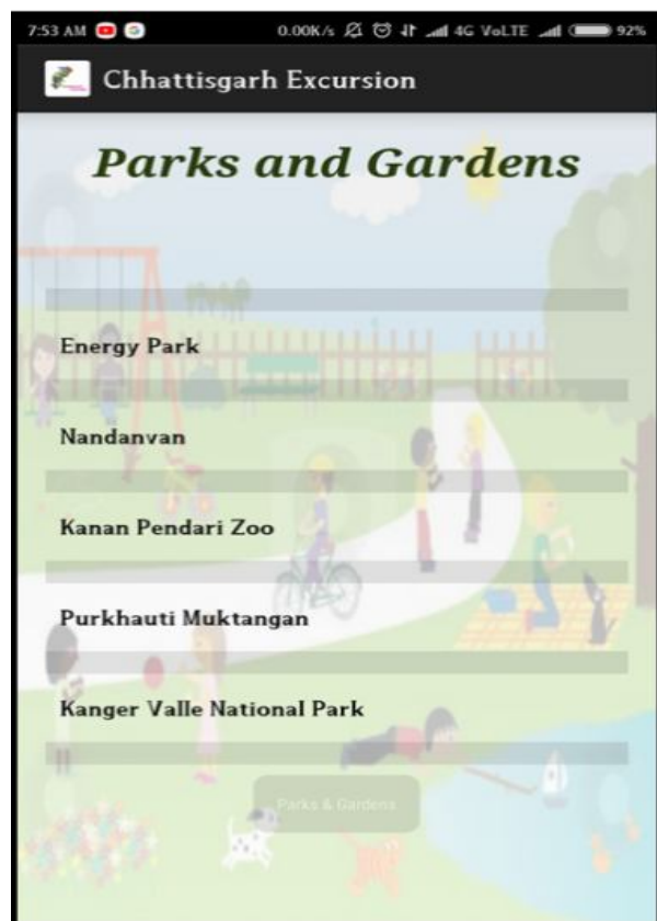
Figure: 3. Parks & Gardens