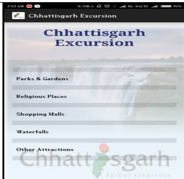
Figure: 2. Home Page