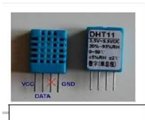
Fig 1:- DHT11 sensor

The DHT11 Temperature & Humidity Sensor is a 4-pin low cost highly reliable sensor. Pin-1 is Vcc, Pin-2 is data pin which collects data from outside world and gives data to the microcontroller. Pin configuration for DHT11 sensor is shown in figure. It features a temperature & Humidity sensor complex with a calibrated digital signal output. It fortifies high reliability and excellent long-term stability. The DHT11 sensor includes a resistive-type humidity measurement component, and connects to a high-performance 8-bit microcontroller, offering excellent quality, fast response, anti-interference ability and cost-effectiveness. Its temperature range is 00-55°C and Humidity range is 20-90%.