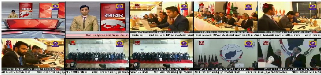
Figure 2: Key Frames determining sharp 'cut'

number of nonzero singular values. With Low Ranks of matrix, we can separate out non-similar frames. Which ultimately gives us sharp cuts in determining shot boundary of input video.