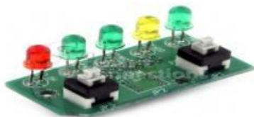
Fig: Front Panel LEDs