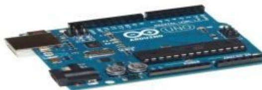
Fig: Arduino Uno