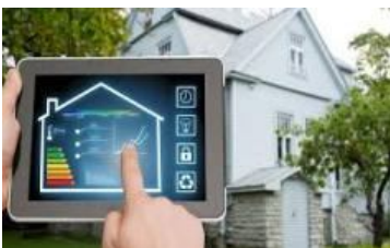
Fig: Smart Meter