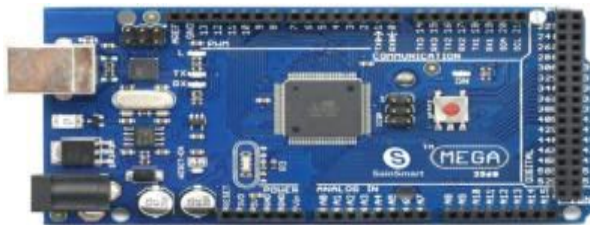
Fig: Arduino At Mega 2560

The features of Arduino At Mega 2560 are: