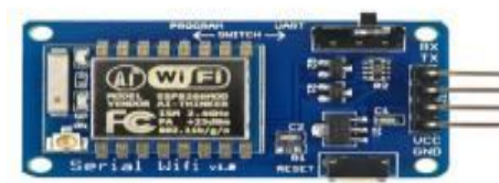
Fig: Wi-Fi module ESP8266