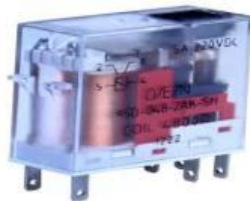
Fig: Relay Drivers