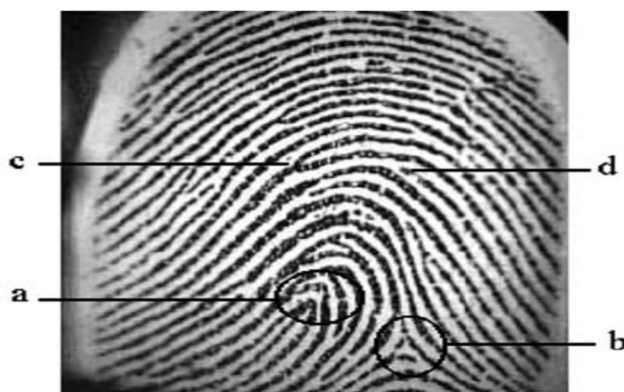
Fig 3: singular points (SP) and Minutiae features are shown in fingerprint image. The specific points are: a)Core point , b) Delta point , c) Bifurcation feature , d) Endpoint feature.