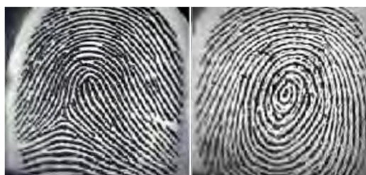
(d) Right Loop