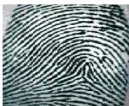
(b) Tented arch