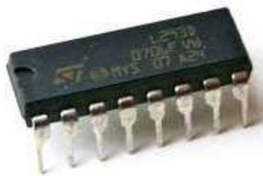
Fig: L293D IC