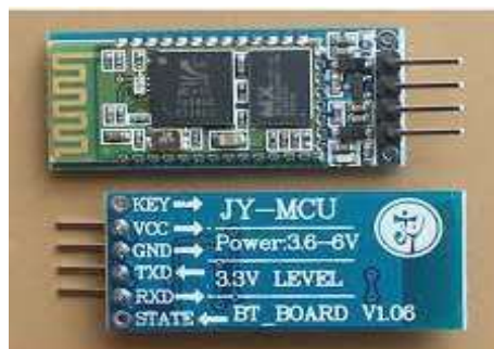
Fig: Bluetooth Module