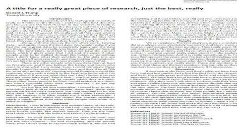
Figure 2 Textual processing