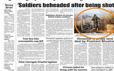
Figure 3 Graphical processing