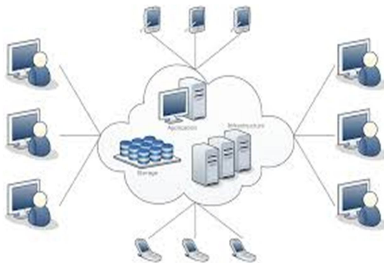
Fig: 1.Basic idea of connection.

In this paper we proposed a new technology for implementation the computer network virtual lab experiments. Using HTML for creating a programming platform and then we use the CSS(Cascading style sheets) and JS(JavaScript) for the style and a major components of this virtual lab.