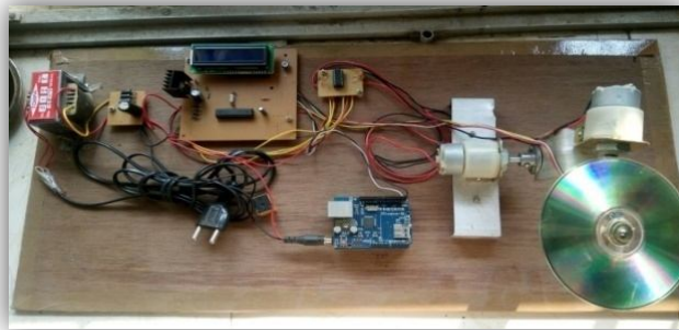
Fig 2: Project setup

In this project antenna positioning system relies on accurate calibration of the rotational velocity of the antenna to determine its angular position.