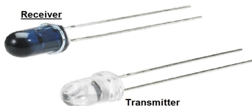
Figure-2: Infrared Sensor