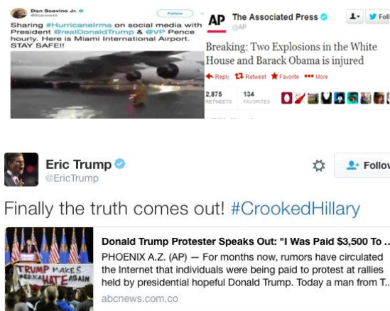
Fig.1 Some examples of fake news

Twitter is a widely used online social platform used by people of every generation and every field. Due to its widespread reach of more than 330 million users, it accumulates all forms of data on its website. Due to this, it is also considered as the 21st-century newspaper because of every users' ability to report major events and incidents across the world. People share articles, videos, photographs, and news through Tweets. Almost 85% of the topics discussed on Twitter are related to news. This paper primarily focuses on the spread of Fake News through short posts called Tweets. Twitter is a free social networking micro-blogging platform that allows users to broadcast Tweets. Twitter has a small size of stories of 280 characters (previously 140) which allows to skim a lot of them fast and hence compensates for them not being ranked by quality. Also, the retweet mechanism is efficient for redistribution of Tweets. The hashtags and trending topics make the search works easier and also help people to look for the events happening [24]. However, this freedom to the user to post anything leads to spread of fake information also [25]. People are also less likely to check the news shared by their friends and hence it leads to spreading of false misleading information at a faster rate [26].