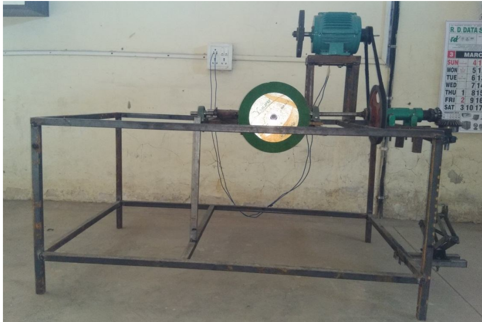
Figure 3.1 Set Up of Multioperational Mechanical System Front View

The most common situation is for a gear to mesh with another gear; however, a gear can also mesh with a non-rotating toothed part, called a rack, thereby producing translation instead of rotation. As shown in project set up figure 3.1, we used dual shaft motor for getting the both side power at the same time for multiple operations to perform which will be placed on a higher platform where on one side of motor shaft we attached grinding wheel. Using this grinding wheel we are able to perform grinding of workpiece. Other side of the shaft is attached to the pulley on which belt is placed for further power transmission. Below the higher platform shaft is inserted in bearing with other pulley in it. Power will come from motor shaft pulley to the shaft pulley end using V belt.