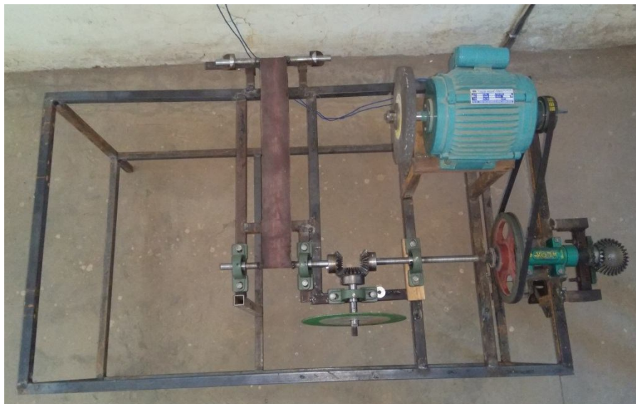
Figure 3.2 Set Up of Multioperational Mechanical System Top View

On other hand, bevel gears will rotate and transmit the power to the shaft connect to the cutting wheel. Also with this bevel gear pinion is mesh and attach to shaft on which the polishing belt placed on it. As per this, all three operations will perform simultaneously using single power supply and at near working centres.