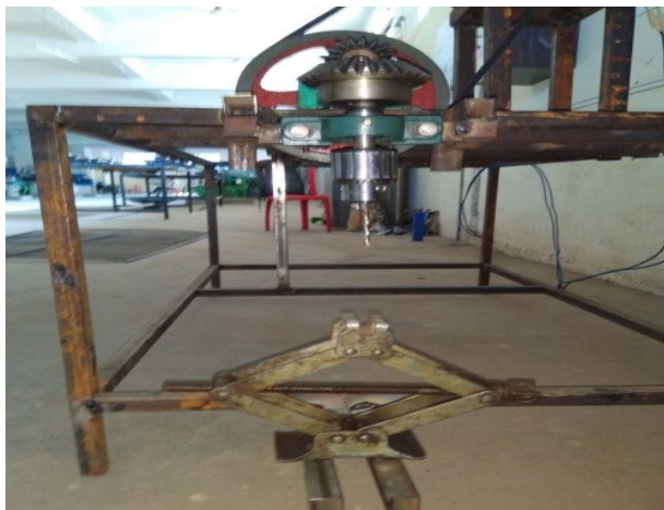
Figure 3.3 Drilling operation

Workpiece is mounted on the toggle jack on which flat plate with nut and bolt arrangement on it to hold the workpiece. Toggle jack is used to move the workpiece up and down while the drill chuck is stationary. In general arrangement workpiece is stationary and drill bit moves up and down.