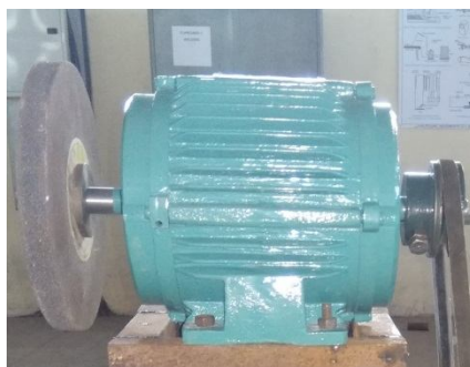
Figure 3.3 Grinding operation

abrasive product. The product used by the grinding machine is generally the rotating wheel. The wheel which is rotating experiences a controlled contact with the work surface. The wheel in the grinding machine is called as the grinding wheel, which is created by abrasive grains that are kept together in a binder. These grains possess a similar functionality as that of the cutting tools which involve in removing tiny chips of material that are generated during the operation. When the abrasive grains become torn and worn out, the additional resistance causes fracture to the grains and deterioration to the bonds. The pieces which are dull break. And only those that are fresh exposing sharp grains endure the cutting operation.