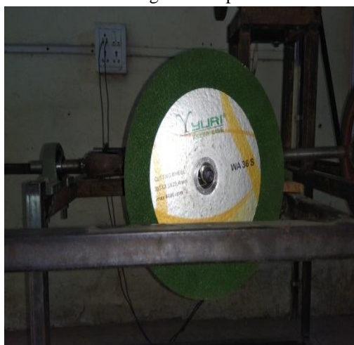
Figure 3.4 Cutting operation

One of the major advantages of sawing over all other kinds of machining is the narrowness of cut op. Most sawing machines perform the cut-off operation, where a piece of stock is cut to a workable length prior to subsequent machining operations. Machines that accomplish this job include hacksaws, band saws and circular saws. As shown in figure 3.1 to perform cutting using cutting wheel. Cutting wheel rotate at high speed and workpiece is hold by worker which cutting according to the requirement.