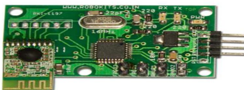
FIG 3.5.1. RF MODULE

RF 2.4GHz Serial Link module is an embedded solutions providing wireless end-point connectivity to devices. These modules use a simple proprietary networking protocol for fast point-to-multipoint or peer-to-peer networking. They are designed for high-throughput applications requiring low latency and predictable communication timing. It should be connected to any TTL/CMOS logic serial RXD and TXD lines and can support baud-rate of 9600bps, 19200bps, 38400bps and 57600bps.