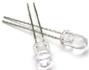
Fig 3.3.1. IR LED

An IR LED, also known as IR transmitter, is a special purpose LED that transmits infrared rays in the range of 760 nm wavelength. Such LEDs are usually made of gallium arsenide or aluminum gallium arsenide. They, along with IR receivers, are commonly used as sensors. The appearance is same as a common LED. Since the human eye cannot see the infrared radiations, it is not possible for a person to identify whether the IR LED is working or not, unlike a common LED.