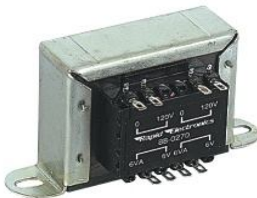
Fig. Typical Transformer

Transformers convert AC electricity from one voltage to another with a little loss of power. Step-up transformers increase voltage, step-down transformers reduce voltage. Most power supplies use a step-down transformer to reduce the dangerously high voltage to a safer low voltage.