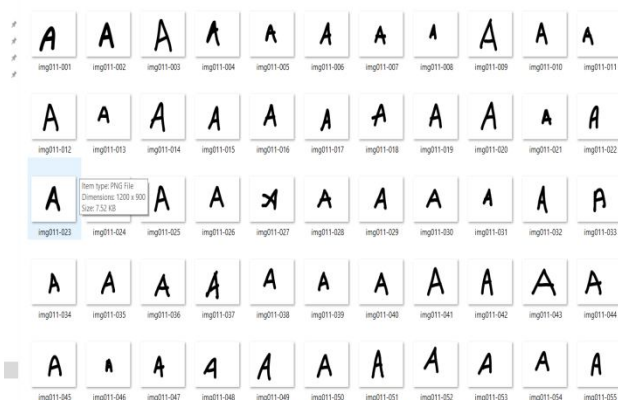
Fig.2. Data base of different A alphabet