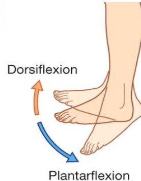
Fig.1 Movement of foot

Dorsiflexion is defined as flexion of the foot in an upward direction and occurs at the ankle. When our foot is pulled into this rigid position, the toes are higher than the heel while considering a horizontal plane. The primary muscles responsible for dorsiflexion include the tibialis anterior, extensor hallucis longus, extensor digitorum longus, and peroneus teritus. These muscles are part of the anterior compartment of the leg. As per the theoretical study movement of the foot for one minute it will produce a significant and sustained increase in the venous outflow.