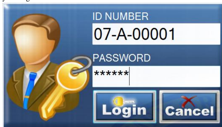
Fig 2. Log-in Form - Program Interface

B.1. Touch the monitor to display the login form below.