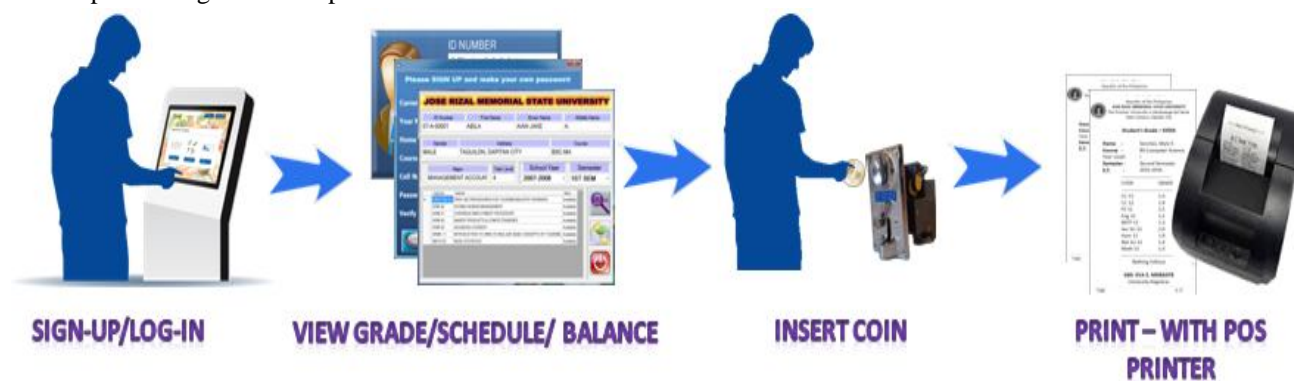
Fig. 1 General System Architecture

A coin slot for a mechanical coin-acceptor unit with a coin slot opening integrated in the front plate, coin slot chamber and coin channel. The shoulder is build-up to vibrate as a coin reflector/membrane so that an impact to the inserted coin in the slot is generated. In the coin slot chamber, there is a renewed reversal of direction in the direction of the coin channel [6]. The whole device is then connected to the parallel communication port and interface using inport32.dll library for Windows 7 Application Programming Interface (API), which is a collection of commands/instructions, protocols, objects and functions used by advanced programmers to create software or interact with external system. It also provides software developers with standard and ready-to-use commands in performing essential operations.