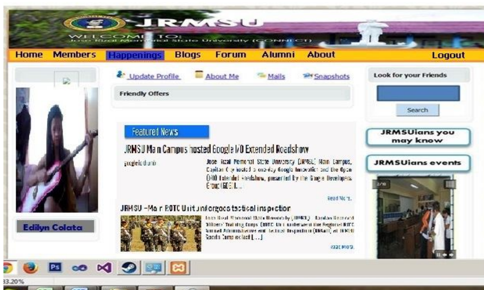
Fig 3. Sample User Interface

Figure 3 is the user's interface used by the JRMSU students/alumni in staying connected with other graduates and to keep them updated on the different happenings inside the JRMSU environment. The program interface is composed of four tabs such as home, happenings, profile and log-out tab. Home tab shows the shout-outs of the registered user which is also shown with the other users. It serves as the current status of the user. The happenings tab tells on the past events, present and upcoming activities. The user can also publish their own invitations which can be viewed by all members of the group. Profile tab consists of the information of each user. Pictures and photo albums can also be viewed on this tab as a compilation of the user's picture. Users can search on members