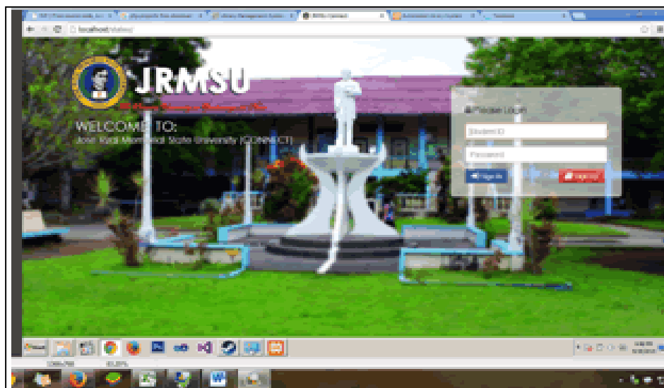
Fig 2. Sample User's Login Interface

The user login interface found in figure 1 is the first screen to be viewed in accessing the JRMSU Alumni social networking site. This requires the user to be a registered member. The user needs to click on the signup button if not yet registered. Registration page will then be furnished by the user to create a profile of every graduate student of JRMSU as an Alumni member. Once the registration is confirmed by the program administrator the user can click on the login button. Log-in requires two fields such as user name and password which were saved in the system's database. If username and password are accepted it then connects to the homepage of JRMSU social networking site.