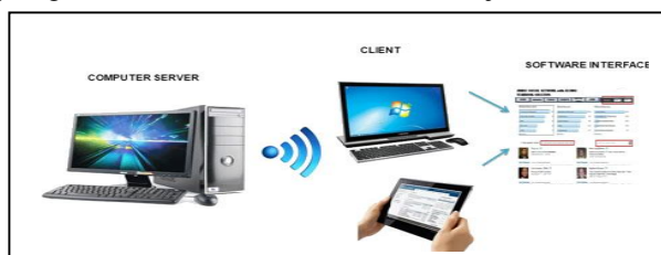
Fig 1. Project Design

Figure 1 shows the design of the system with the features it contains. It is supported with the different multimedia linkage like instagram, youtube, and a lot more to make the system not just for text formatted information but also for entertainment like post. Forum is available to all members for an open-up discussion on different topics concerning them. There is also a tab for events wherein ongoing and upcoming programs of the school and even the activities of the off-school members will be posted to invite the members on the said event. Job corner is opened so that companies can add job opportunities if available and also alumni who knows job openings can post directly to give avenue of the student/alumni or job seekers.