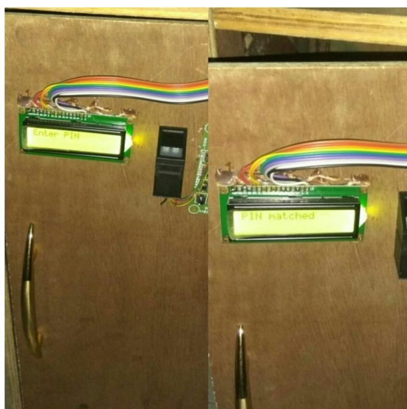
fig.(3) :-PIN Access