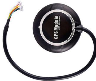
Figure 6. GPS

The GPS model used is the NEO M8 GPS module. It is used to get accurate position and help in course tracking by using waypoints set.