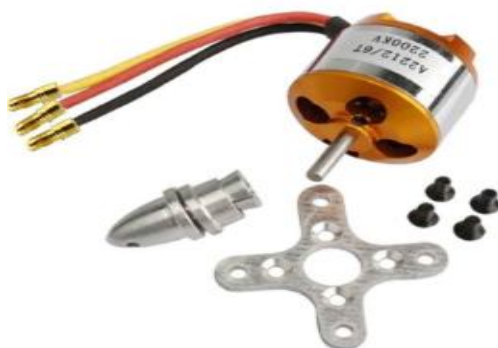
Figure 2. BLDC Motor 1