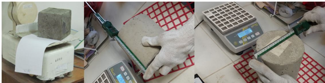
Fig. 2 Measuring the geometric dimensions and weight of test specimens

For all the specimens the geometric dimensions and weight is measured, after that the weight per unit volume \gamma_c is calculated (Fig.2).