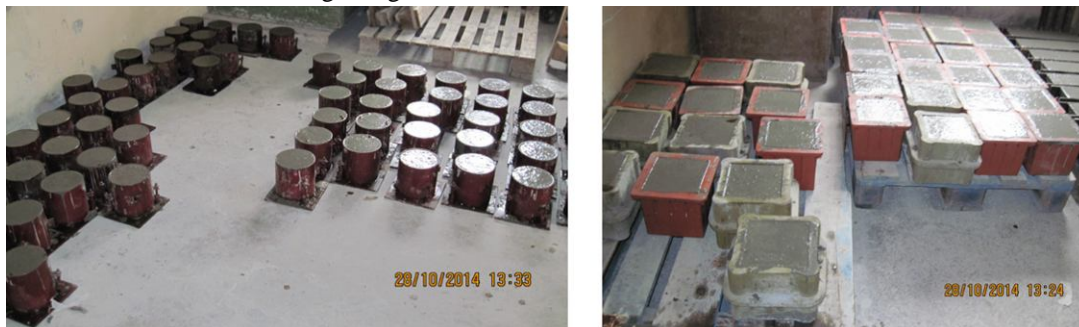
Fig. 1 Specimens for testing according to EN 12504-4:2004 [2]

For the researches for modulus of elasticity of the concrete 54 cylindrical test specimens with dimensions 150/150 mm and 27 cubic test specimens with dimensions 150/150/150 mm were produced (Fig.1) according to EN 12390-2:2009 [5], [7]. They were prepared of concrete grade C25/30, fine fraction of coarse aggregate ( d_{max}=12 mm), consistence S3. Test specimens were with precise dimensions, flat and smooth sides, straight edges and corners.