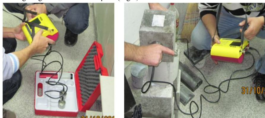
Fig. 3 Determining the modulus of elasticity of concrete with portable ultrasonic testing instrument type Proceq-TICO

Experimental investigations for determining the modulus of elasticity of concrete based on measured velocity of ultrasonic pulse, using the Non-Destructive Ultrasonic Pulse Velocity Method were performed with portable ultrasonic testing instrument type Proceq-TICO [9] with measuring range from 15 to 6550 \mu\text{sec} (Fig.3).