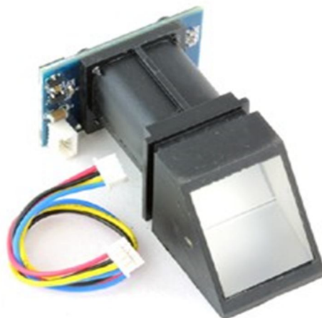
Fig. 2 Fingerprint Module

This is a fingerprint sensor module having the TTL UART interface for direct connection to the micro controller to PC through MAX232 / USB-Serial adapter for communication. The fingerprint data store in the module and it can configure it in 1:1 or 1: N matching for identifying the individual's identity. The Fingerprint module can directly interface with 3v3 or 5v Micro controller. A level converter (like MAX232) is necessary for interfacing with PC serial port. The optical bio metric fingerprint reader having great features and can be embedded into a varieties of end products, such as access controls, attendance system, safety deposit boxes, car door locks [5].