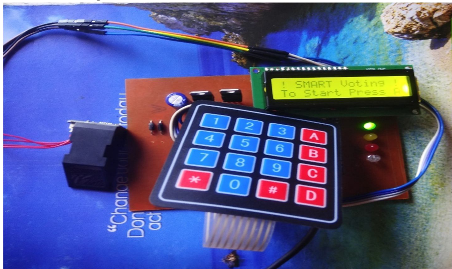
Fig. 3 Aadhaar Based EVM

The microcontroller which we are using in our project will take only 3.3v of a power supply as it is low power consumption. After switching the power supply, to press the reset button. The first mode is to register the fingerprints, so voter should have to keep the finger on the optical scanner where it scans the image and saves it with a unique id number. From microcontroller, we have to give connections to the LCD display in order to show the process of voting. Switches are also connected to the microcontroller where we have 16 keys in which four keys (A, B, C, D) are used for different parties and Numeric keys are used for Entering Aadhar Number and # key is used to indicate the end of input.