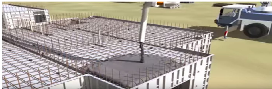
Fig. 1 Pouring of concrete