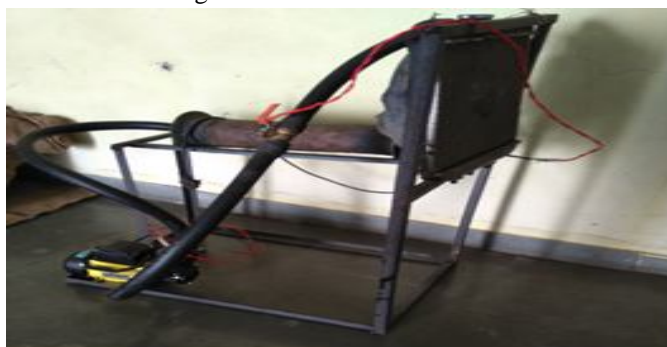
Fig. 4.1 Experimental Setup

The experimental setup of the project is as shown in figure 4.1 below: