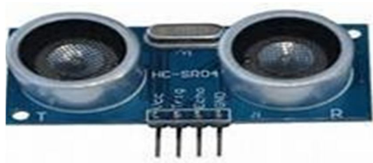
Fig. Ultrasonic Sensor (HC-SR04)