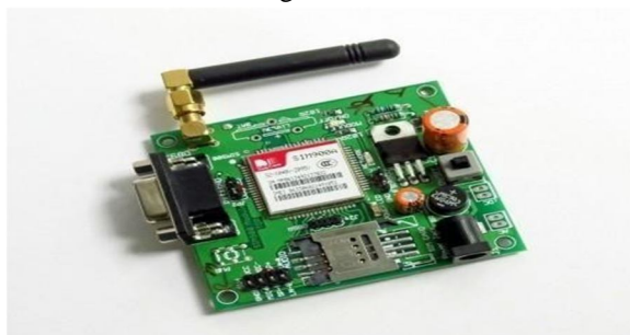
Fig. GSM Module

GSM module is connected to a Network; this allows using the GPRS and SMS to communicate over the mobile network for this project. Control signals came from controller sent to cloud using GSM Module.