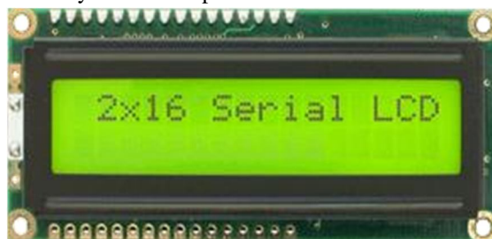
Fig. 2X16 LCD Display

LCD's have been become most popular over recent decades for Data/information visible in many smart devices. The Display devices are mostly controlled by controllers. They makes complex/convolve devices easier to operate.