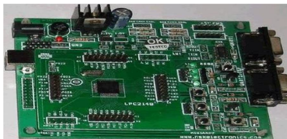
Fig. LPC2148 (ARM7)