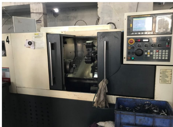
Figure 1. CNC Turning Centre