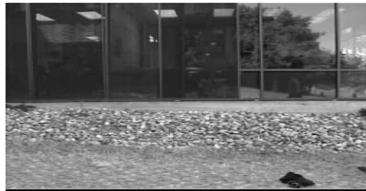
Fig 4. Reference Image

To perform background subtraction, we need a static reference image. Fig.4 shows the result of reference background image. Reference image contains image which has static information.