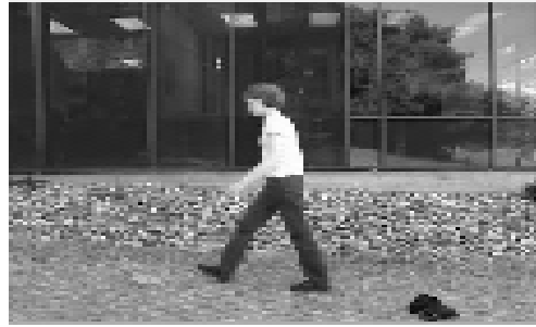
Fig 2. Captured Video