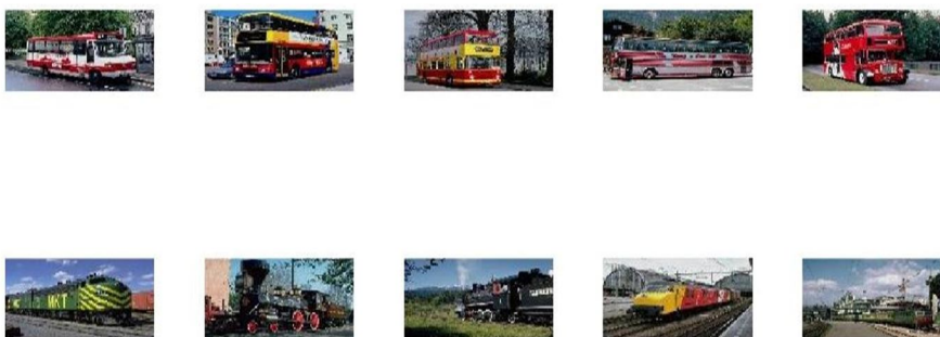
Fig.3 result of image retrieval process (query image = 'BUS category')