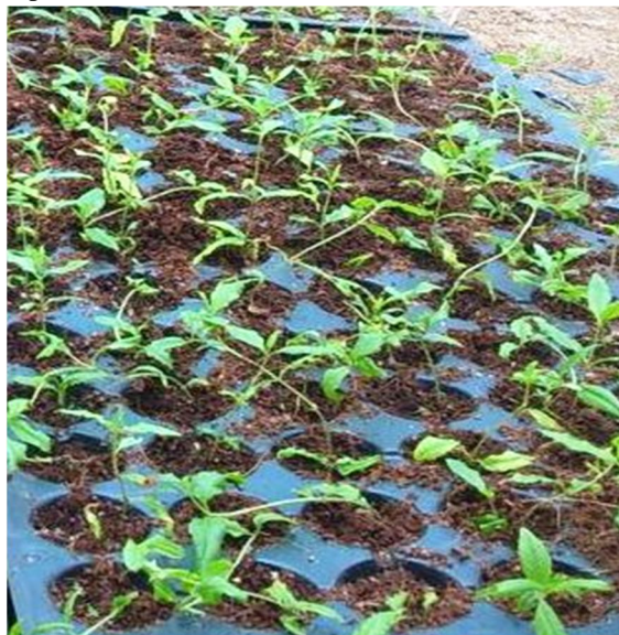
Fig.3 Hardened plants

The above table represents the ability of the media used for hardening that enables the plants to attain the maximum survival rate and height of the plants. Primary hardening used compost and vermicompost which showed 96.5% survival rate in compost media and 85.6% survival rate in vermicompost media. In continuation with primary hardening, secondary hardening responded well with the combination of red soil, sand and compost in the ratio 1:1:1.