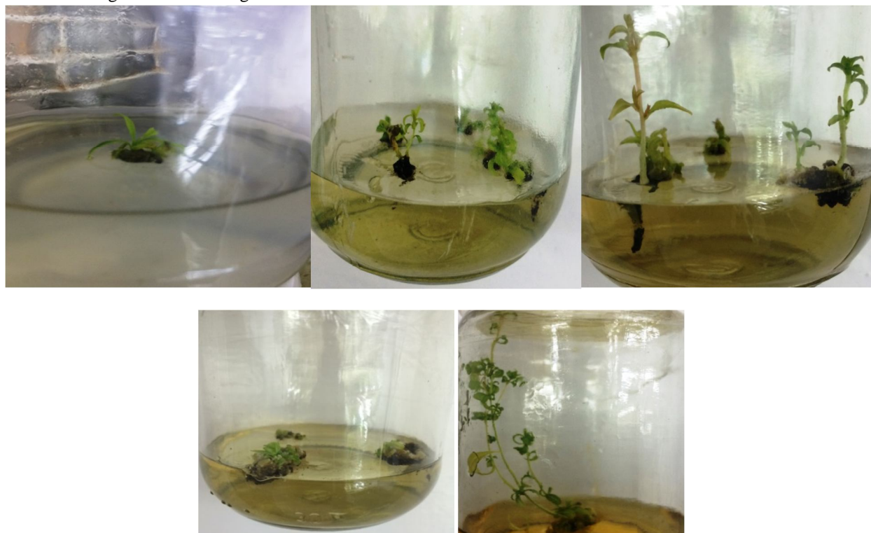
Fig.1 Proliferation trials

According to the observation, the multiplication efficiency was found to be higher with the number of shoots and the height of the shoots in the media trialed with 6BAP – 5 mg/l. When GA was added in combination with 6BAP, the growth is slightly dull and freshness is lost during the sub-culturing and rate is slow.