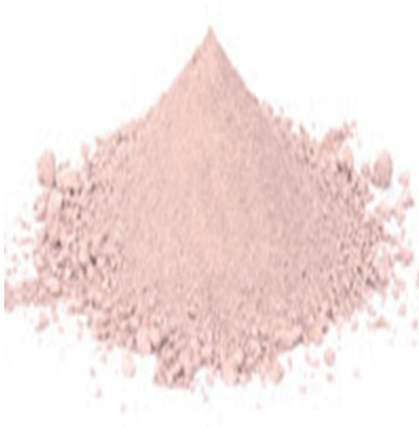
Figure1. Buff colored Metakaolin